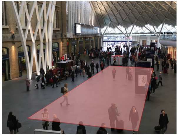
4. – Western Concourse