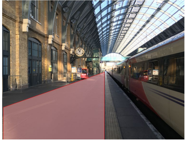
2. – Platform 8