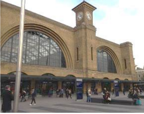
1. – King’s Cross Square