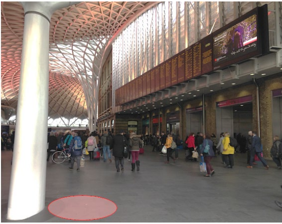
3. – Main Entrance