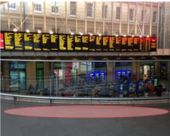
5. – Mezzanine