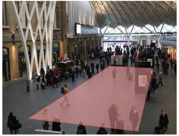
4. – Western Concourse