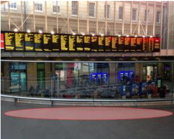
5. – Mezzanine