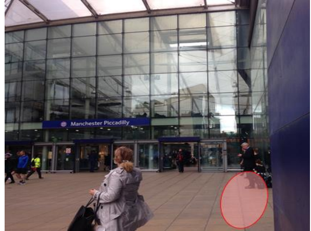
4. – Main Entrance