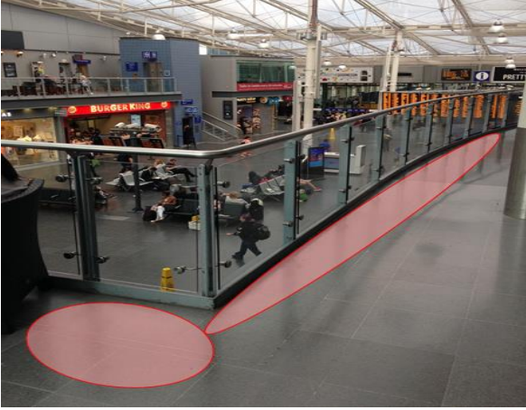
1. – Mezzanine