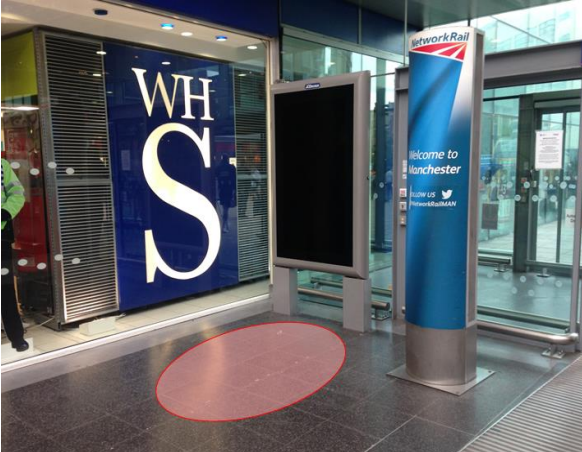
3. – Concourse