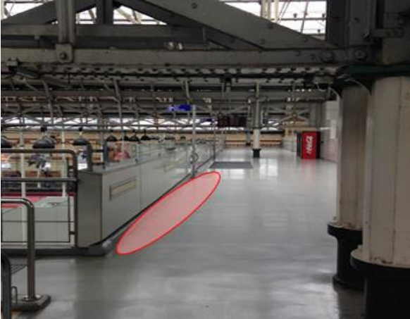
5. – Elevated Walkway