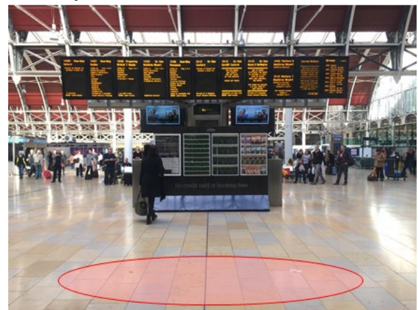
4. – Departure Boards