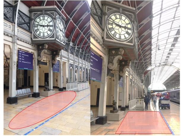
2. – Station Clock