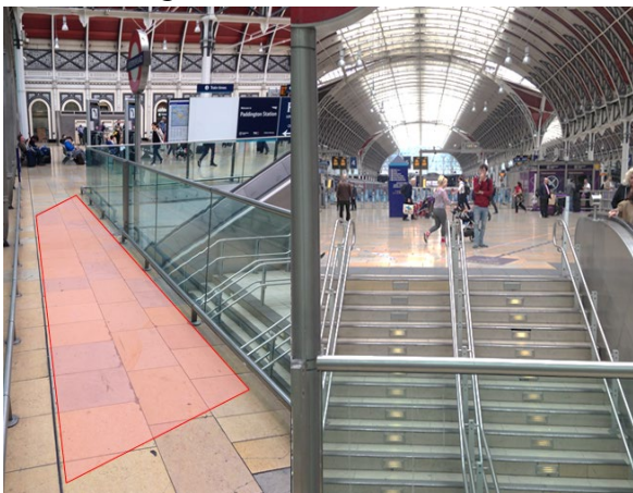
3. – Underground Entrance