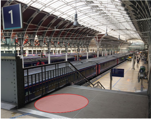
1. – Platform 1 Walkway