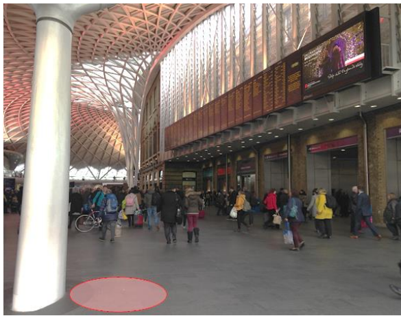
3. – Main Entrance