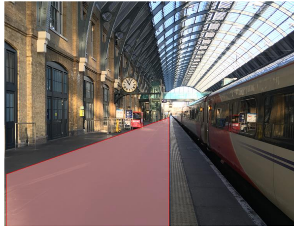
2. – Platform 8