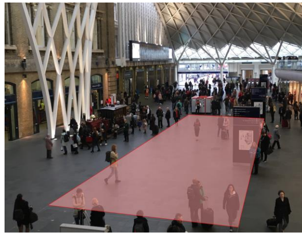
4. – Western Concourse