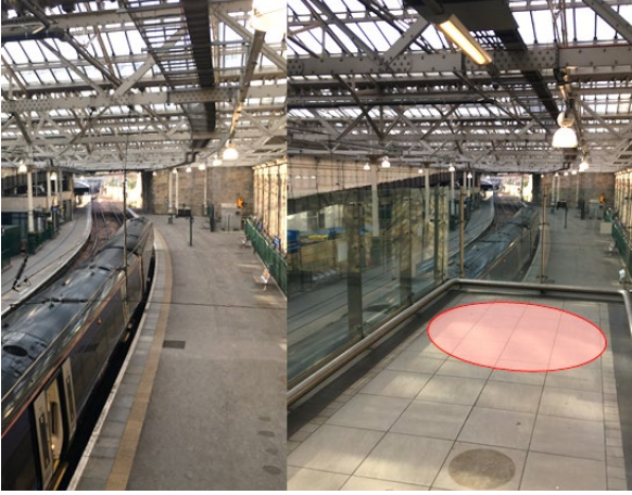
1. – Above Platform 20 (escort required)