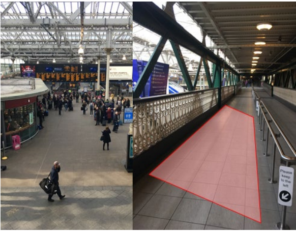
3. – Overbridge (escort required)