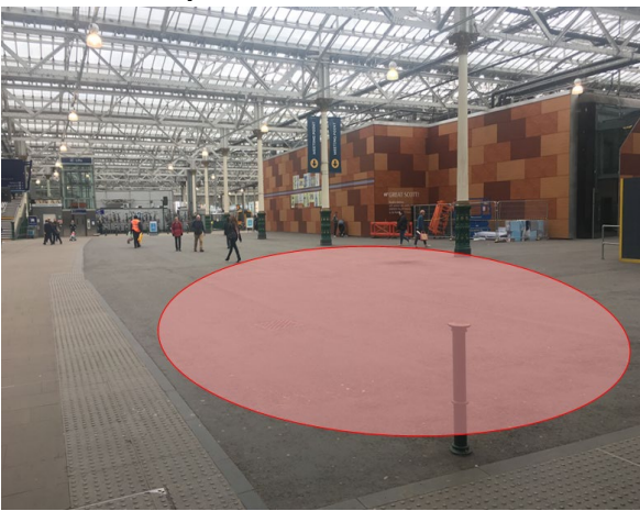
5. – BlackTop