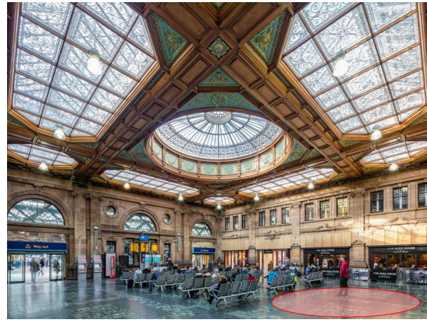
4. – Departure Lounge