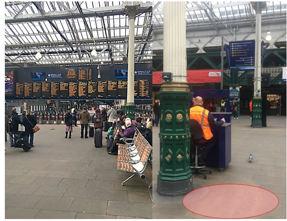
2. – Departure Boards (escort required)