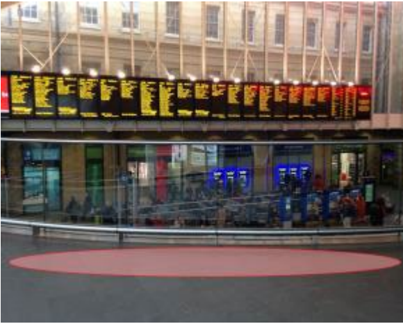
5. – Mezzanine