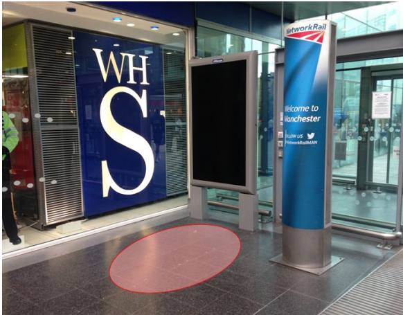
3. – Concourse