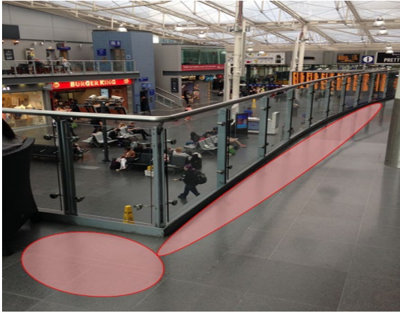
1. – Mezzanine