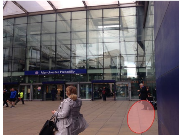
4. – Main Entrance