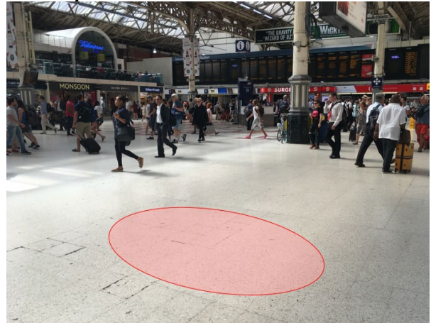
4. – Departure Boards