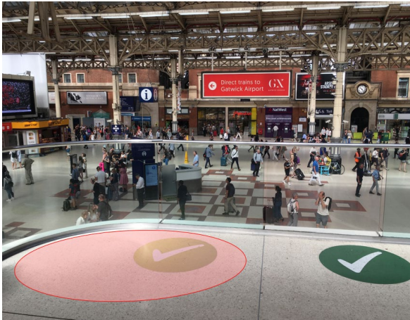
3. – Mezzanine