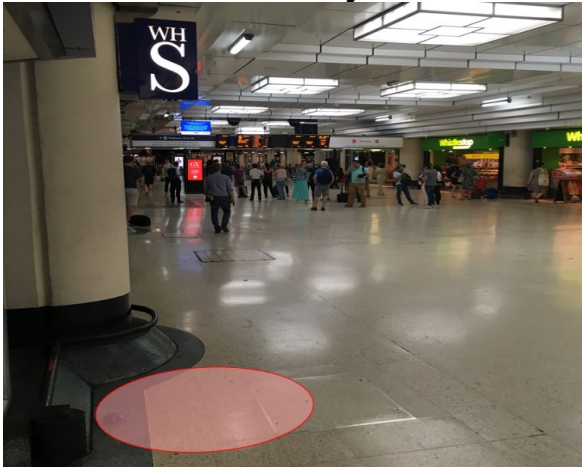
5. – South Coast Gateway