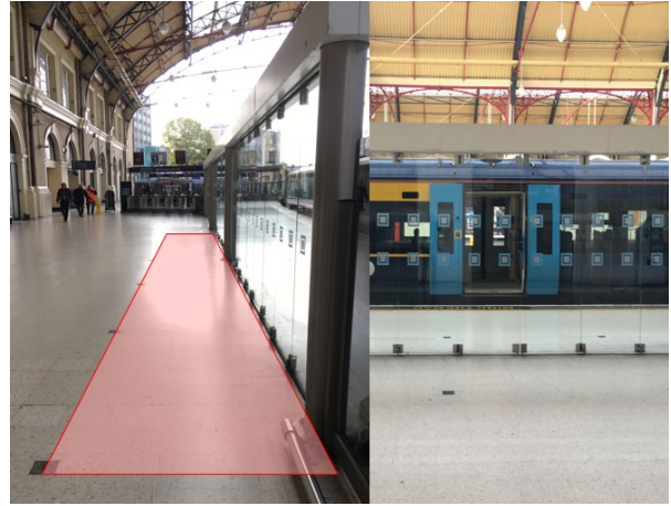
2. – Platform 2 Glass Doors