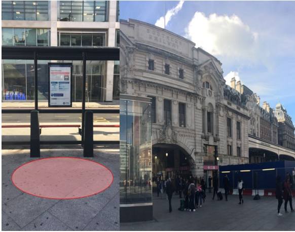
1. – Main Entrance